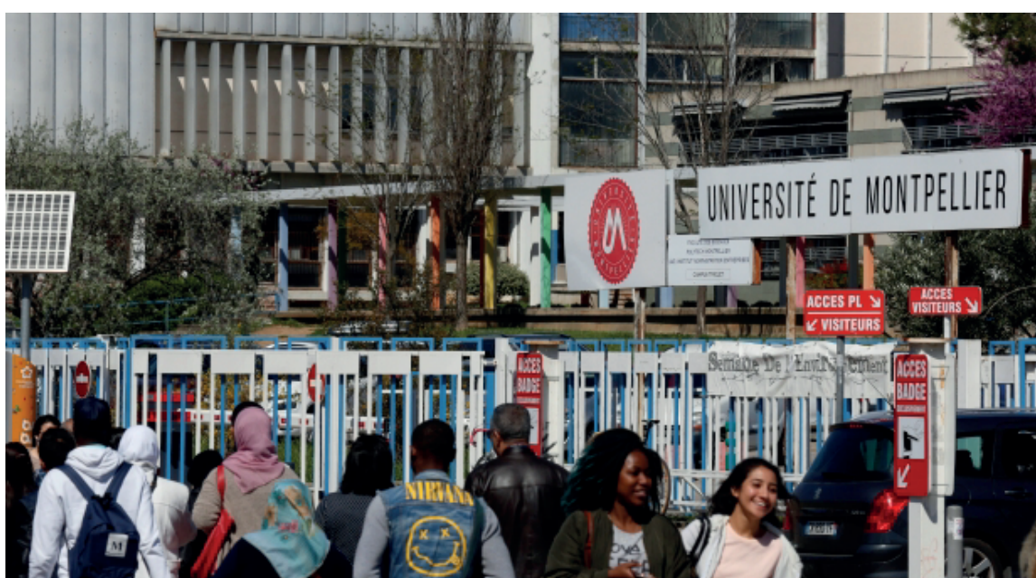
University of Montpellier.

Montpellier's integration policy continues to seek further development. The city's coordinated integration policies have been able to address the rapid influx of refugees of the war in Ukraine and other crises. Montpellier is a member of Cités Unies France 49 and plays a key role in the networks' working group on migration, through which city leadership transfers best practices and policies to cities that are less prepared for migrant influxes. However, Montpellier could benefit from the strengthening of national and local policy frameworks. Further knowledge transfer could fulfill the need to enhance the city's capacities for the emergency construction of prefabricated housing. Additionally, France currently has no specific asylum status for climate refugees, a legal shortcoming that could hinder Montpellier's integration processes in the future. Nonetheless, Montpellier's intercultural heritage and integration policy has equipped city leadership for future global challenges.