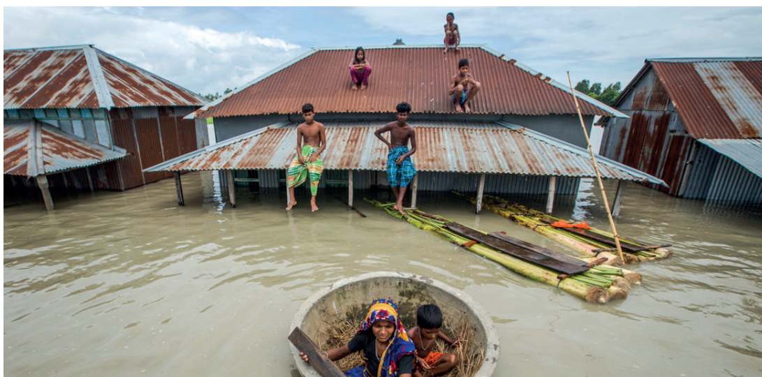
Floods in the Ganga-Brahmaputra basin.

The 2021 Global Report on Internal Displacement estimates that over 30 million people are internally displaced by weather-related extreme events in 2020, with storms and floods standing out as the most common drivers. 13 Regionally, the most severe disaster-related displacements were experienced in East Asia and the Pacific, and South Asia, where about 21 million people were displaced. Small island states in the Caribbean and South Pacific are disproportionately affected by the impacts of climate change, particularly due to rising sea levels.