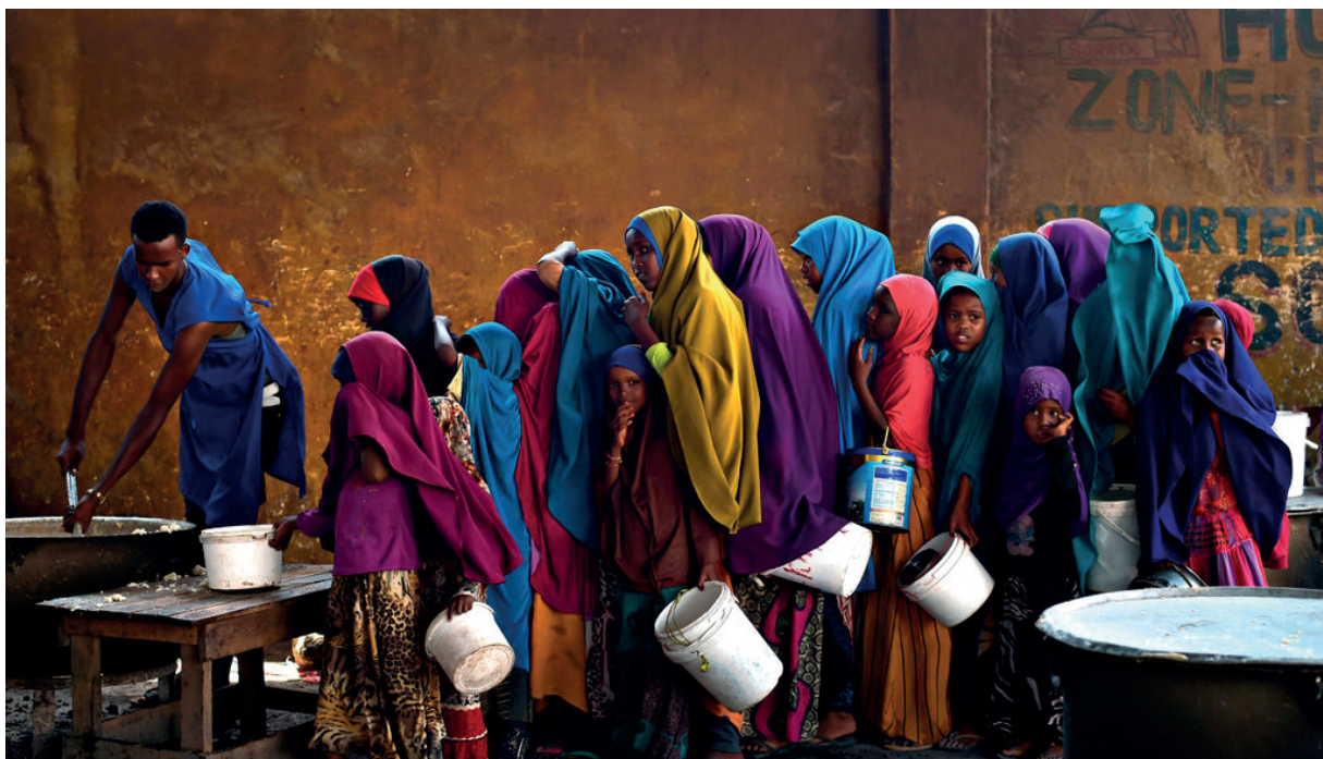
Young Somali girls line up for porridge at a feeding center in Mogadishu.

Additionally, the shifting definitions of climate migrants and refugees, who are often excluded from legal frameworks for migration, pose challenges for cities to support those displaced or seek asylum due to climate change. 38 Along these lines, ActionAid International observes that “in the scenario of worsening climate impacts, maintaining the strict differentiation between ‘refugees’, ‘economic migrants’ and ‘climate migrants’ may become increasingly impossible.” 39 With climate-related migration projected to increase in the coming decades, policies on climate migration will prove more important, and perhaps more contentious, than ever. This observation is supported in the findings from interviews with city officials, as will be discussed in the next section of this report. Ultimately, an integrated and comprehensive policy response is necessary to address the interconnected issues of climate change and migration.