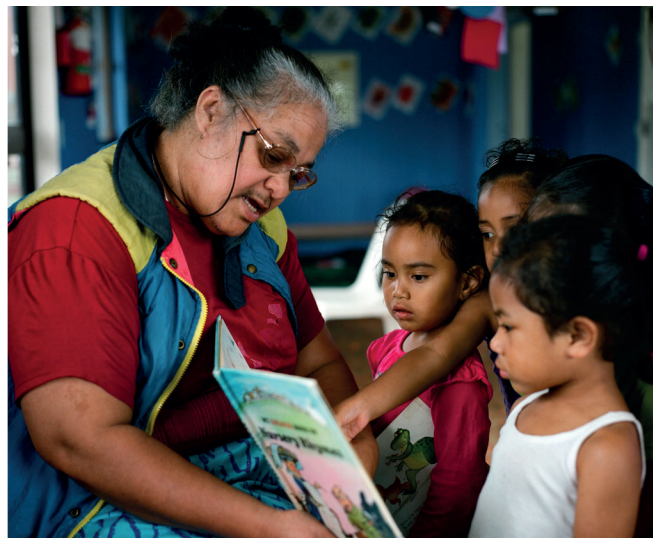
Displaced by Children displaced by sea level rise at a care center in Auckland.

To address these pressing challenges and welcome migrants with an open heart, Braga heavily relies on its international and regional networks. To promote the integration of migrants into the economy, the city has implemented a project with support from the European Union, which seeks to encourage a mutual recognition of different cultures, uniting local and migrant populations. 45 The national legislation for the acquisition of work permits and residence cards have liberalized over the last thirteen years, making it more accessible. At the local level, the municipality has a Parish council with representatives from Brazil, Ukraine, and other countries. These representatives play a key role in providing migrant communities with housing, food, and support with immigration paperwork. Migrant children are encouraged to pursue education in local schools. Promoting inclusion of cultures, schools offer language classes and recruit teachers who speak the native language of migrants. Gouveia remarked that language promotes a “strong connection” amongst migrants, especially the “Brazilian Brothers” who also speak Portuguese. Lastly, underscoring the need for city-to-city learning, Hélder Costa emphasized the “need for politicians to talk to each other, for city professionals to connect with and learn from each other, and share best practices.” Overall, Braga employs multiple methods in a holistic effort to integrate migrants into their "intercultural" city. 46