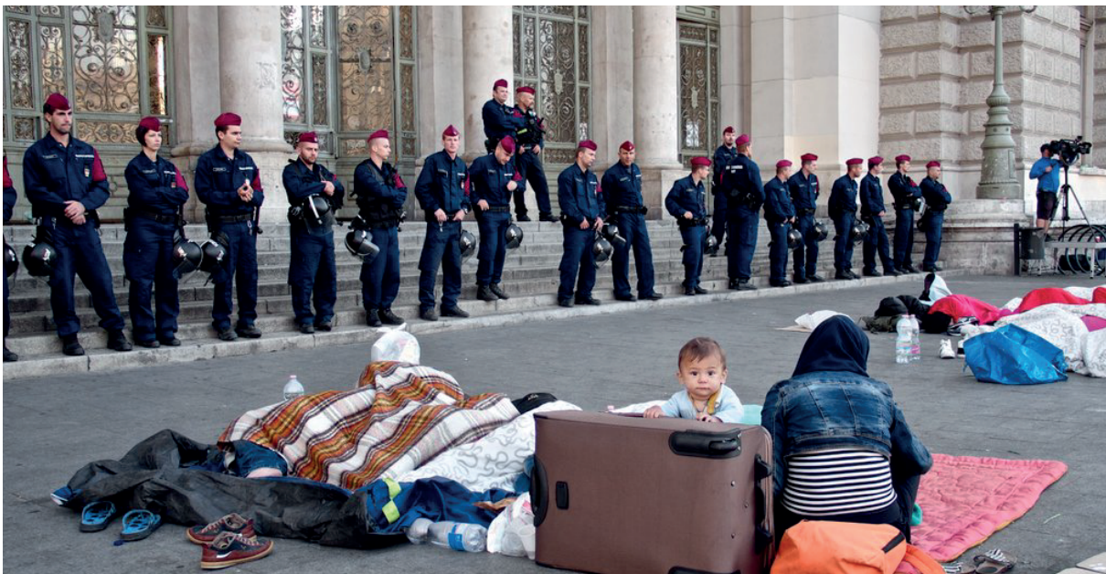
Refugees in Budapest.

Climate change and migration are intersecting realities for millions of people millions of people who live in cities across the world. Cities, city networks, and policy experts are increasingly applying diverse solutions to the broad range of challenges posed by these phenomena. However, rapid rates of urbanization and widening inequalities continue to strain the physical and social infrastructure of cities, increasing the vulnerability and exposure of local communities to climate risks (Figure 1). Cities are thus both “sites of increased exposure to risks” 6 and actors of urban governance that advance local solutions to global challenges.