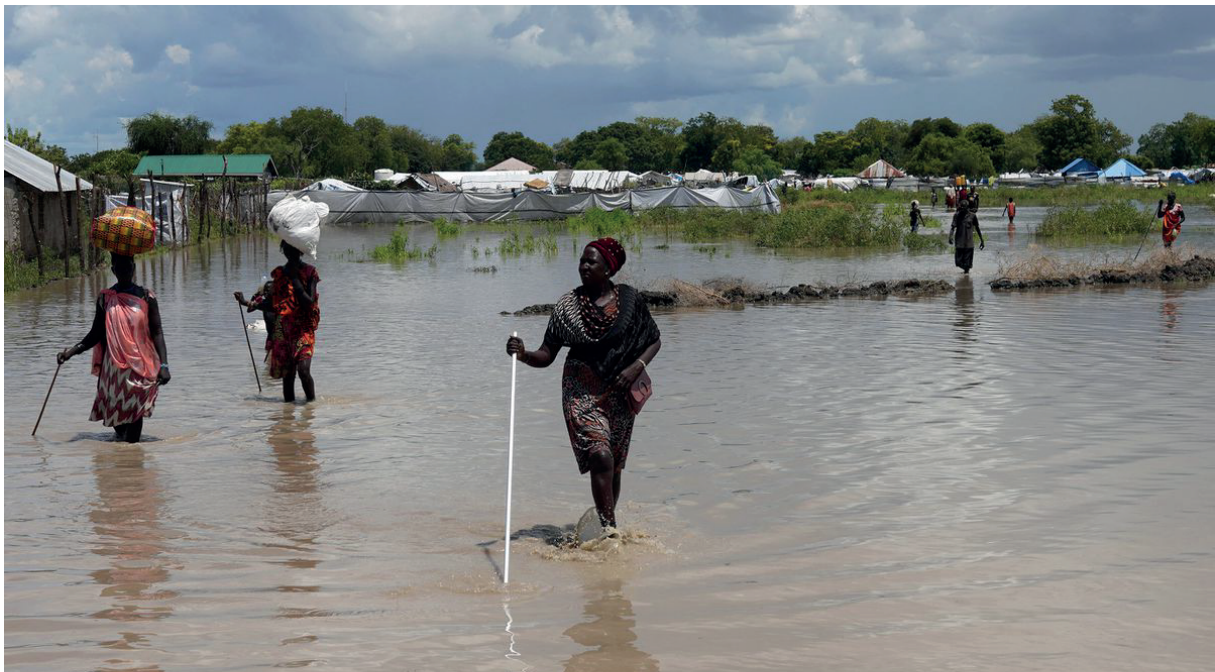
Floods in South Sudan.

Housing more than 53,000 people, Iganga is a municipality in the Busoga region in eastern Uganda. Landlocked and located ninety miles north of Lake Victoria, the city has a tropical climate and receives rainfall even in its driest months. Iganga experiences both seasonal and permanent migration. 43 The municipality welcomes migrants from conflict-ridden regions of Kenya, Sudan, and the Democratic Republic of Congo. Many migrants and their families have been forced to move to Uganda due to unstable economies and precarious living conditions in their countries of origin. Within Uganda, people from rural parts of drought-stricken northern regions move to Iganga in pursuit of food, water, jobs, and pastures for their cattle.